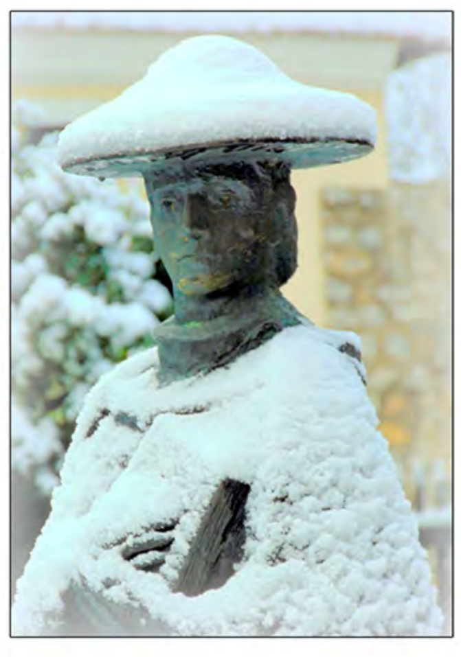
Front and back cover: